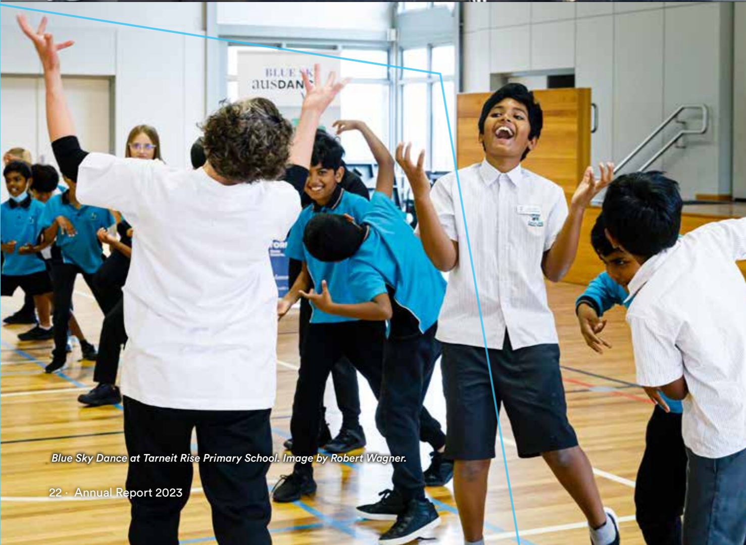
Blue Sky Dance at Tarneit Rise Primary School.