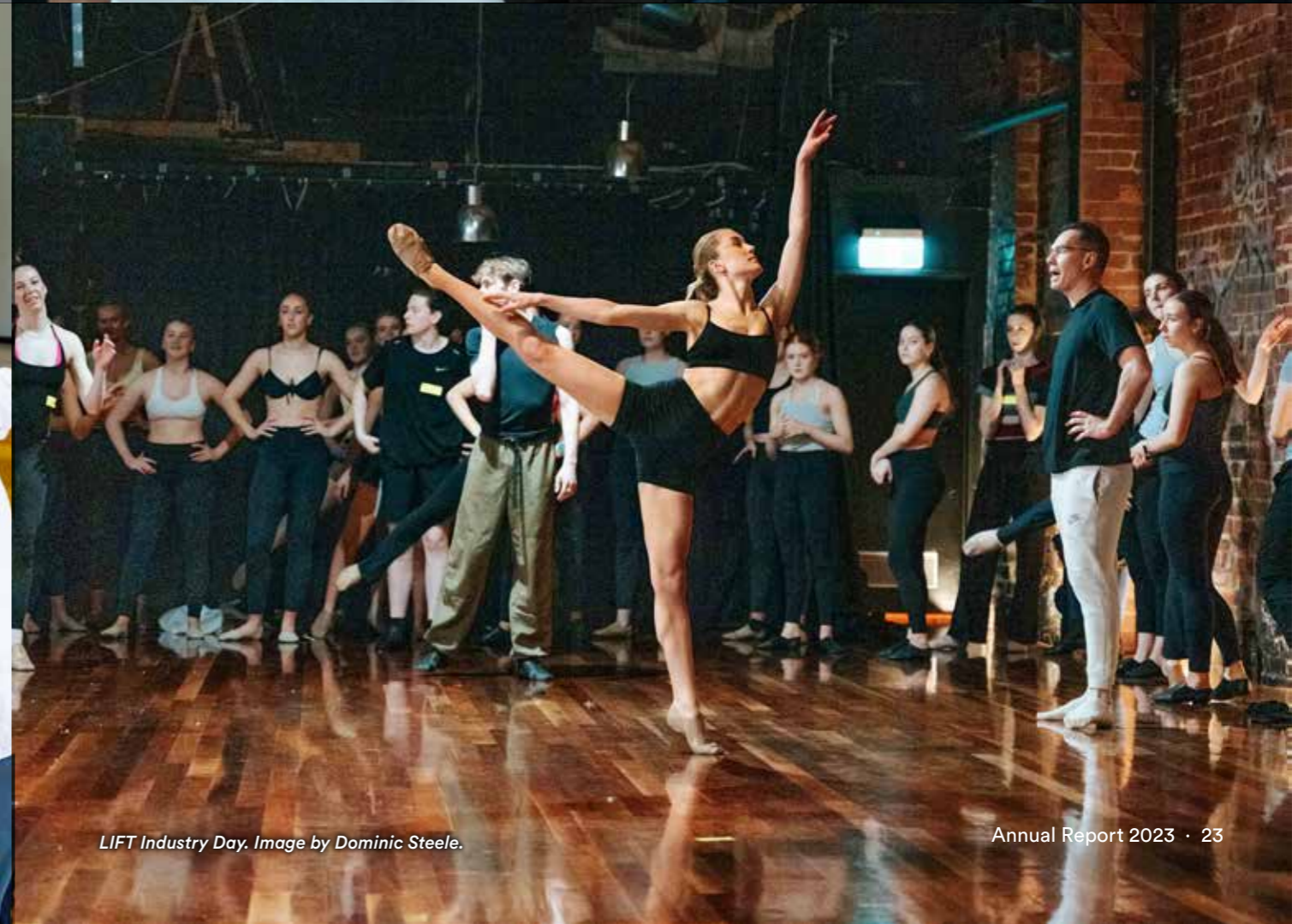
LIFT Industry Day.