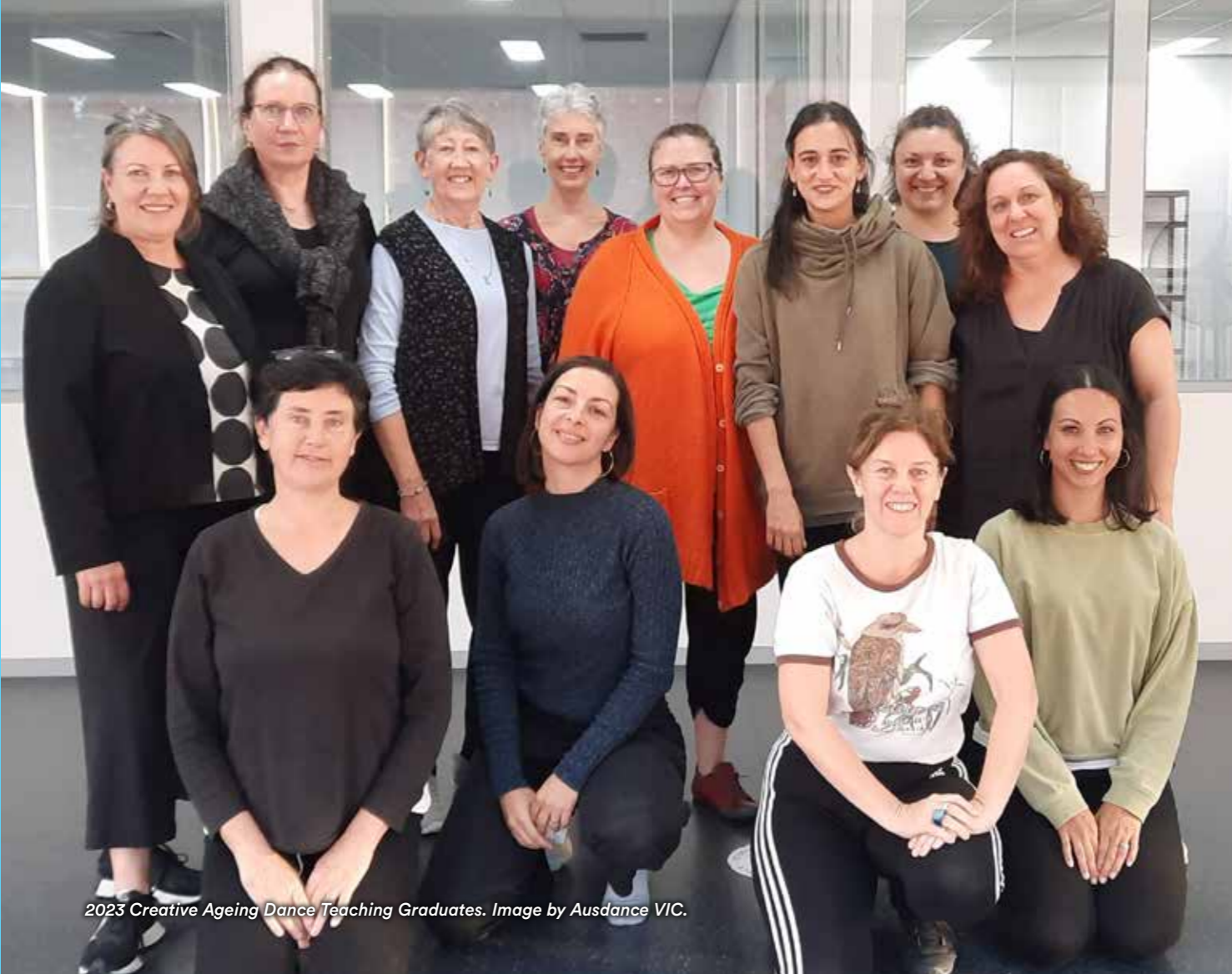
2023 Creative Ageing Dance Teaching Graduates.