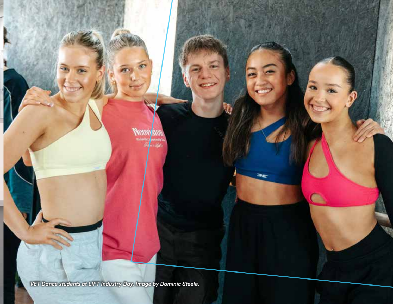
VET Dance students at LIFT Industry Day.