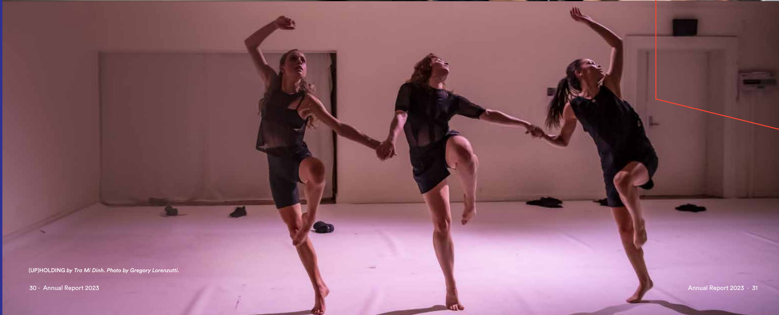
(UP)HOLDING by Tra Mi Dinh.