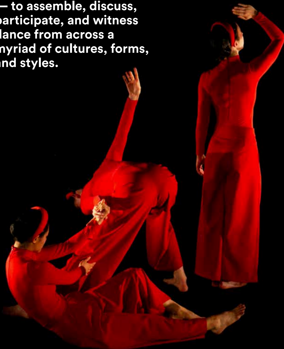
SERMON by Rhys Ryan.

FRAME: A biennial of dance was an invitation to celebrate and connect — to assemble, discuss, participate, and witness dance from across a myriad of cultures, forms, and styles.