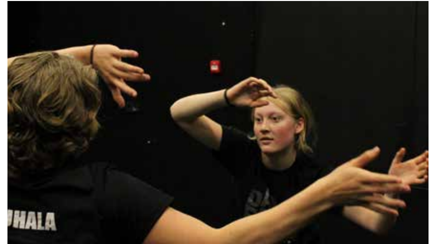
Company photographed: Hurja Piruetti