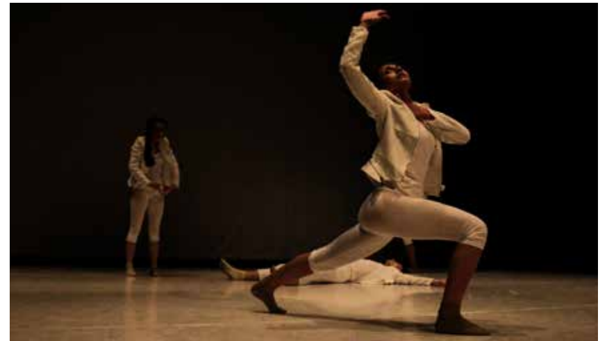
Company photographed: RDC Youth