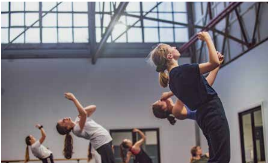
Company photographed: Origins Dance Company

Close your eyes, check in with your bones, connect with others and the space around you. What do you bring to the world, and what do you leave behind?