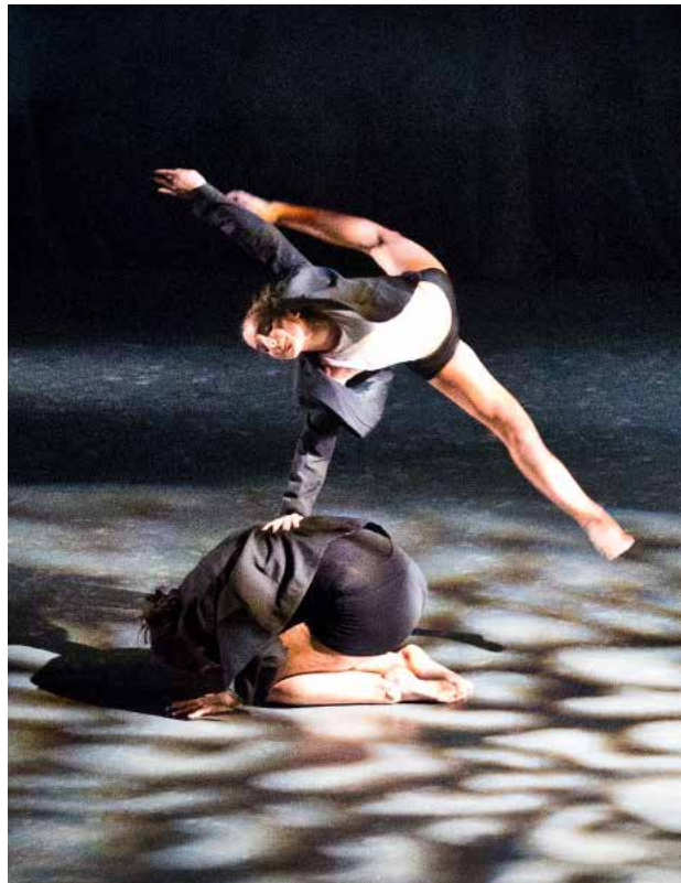
Company photographed: The Flipside Project (Catapult Dance Choreographic Hub)

This session will give you a physical insight into how relationships form between bodies and space. Through different partnering techniques, you will discover how to build movement structures and phrasing that speak with great purpose and intention.