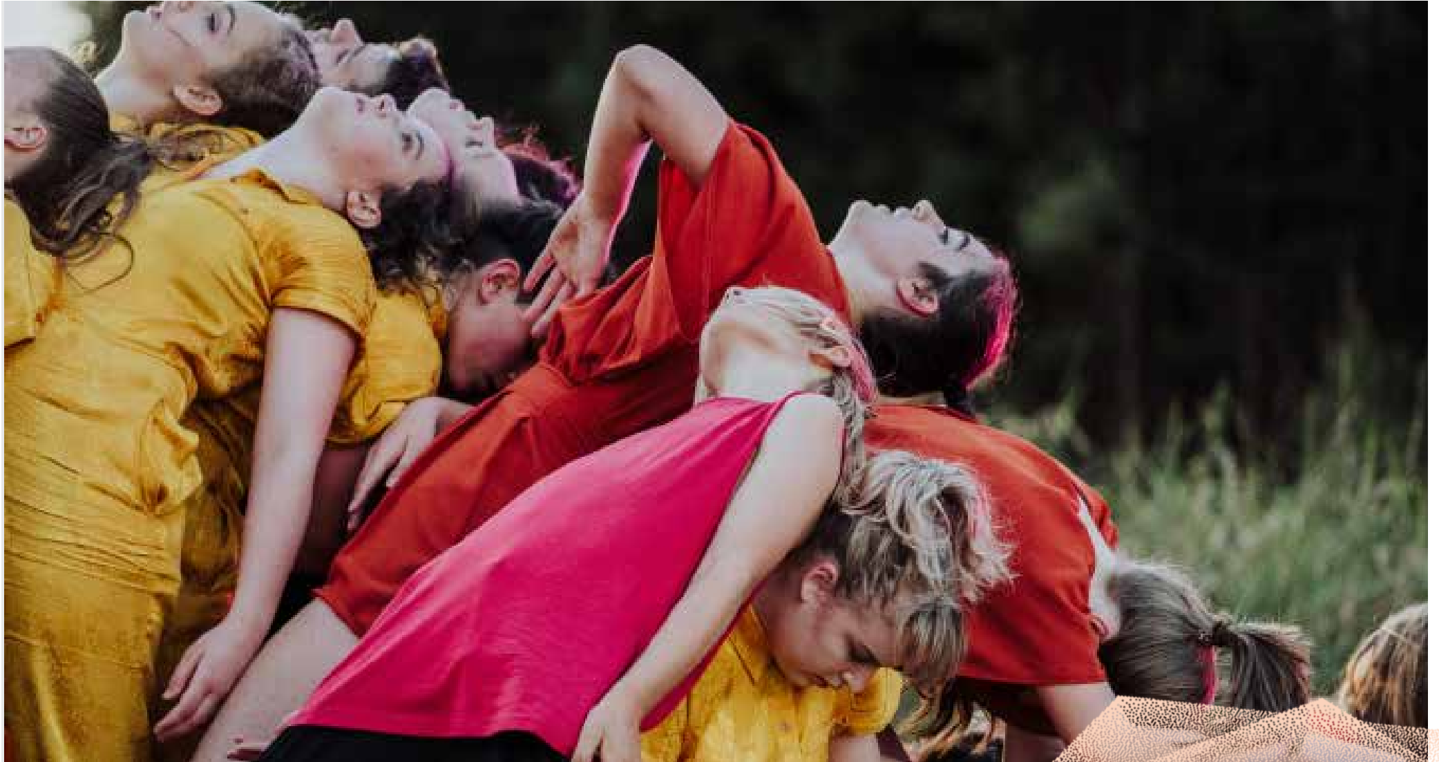
Company photographed: Stompin