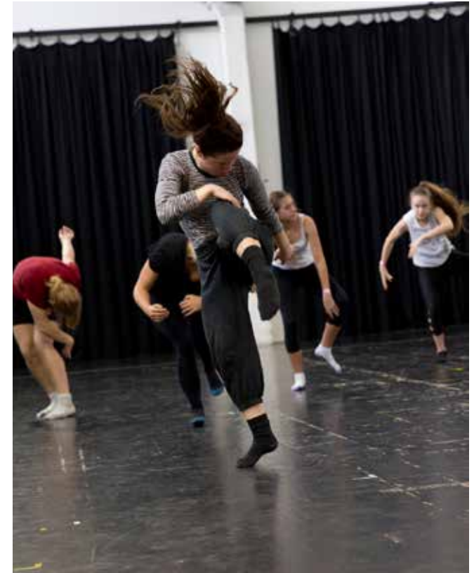
AYDF 2017

We will start gently, aware and considered, taking some time to apply, listen and organise, so that eventually we can surrender to abandon, energy and fun. We will play with instinct and trust, both in response to our selves and to others, letting creativity happen, within us, and to us.