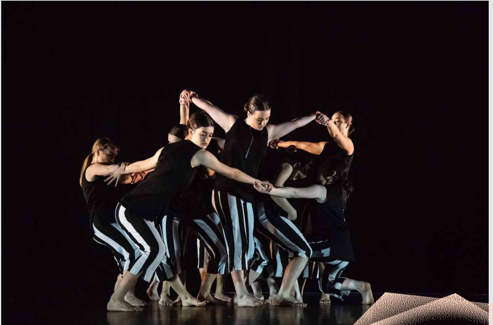
Company photographed: QL2 Dance