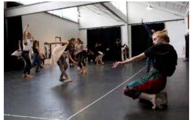
AYDF 2017