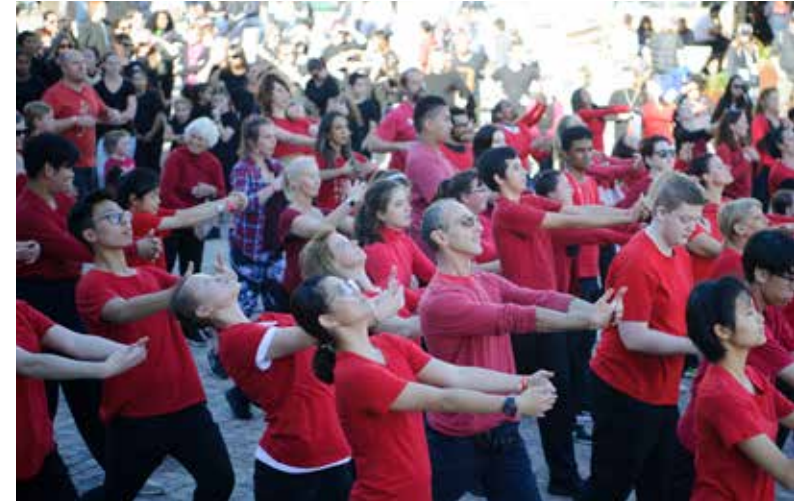
Big Dance Melbourne 2018

Youth Dance Australia (YDA) is a collection of youth dance companies and artists who provide a platform and raise awareness about the outstanding work that young Australians experience in the pursuit of creative and process-led dance making. Each member of YDA has extensive expertise and knowledge of working with young people, and offers programs and opportunities for the next generation of contemporary dancers to pursue a career in dance. YDA members pride themselves on creating an environment where the development of innovative contemporary dance is fostered and nurtured through rigorous dedication and a passion for the art form, and inclusion, equality and diversity are celebrated.